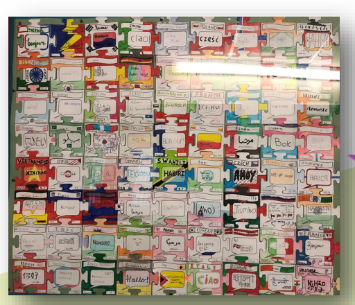
The Modern Foreign Languages Department's Jigsaw of Languages

Fund raising ideas were discussed - as were issues students wanted to explore - ready to be taken to our Head Students to keep our community thriving.